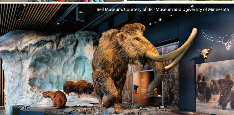
Bell Museum.